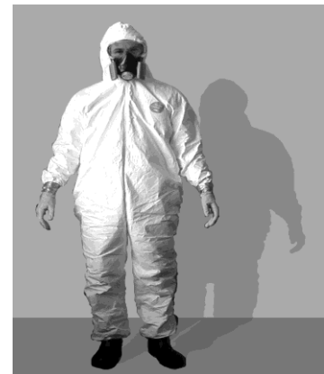
Protective clothing and equipment

If you must leave the plastic containment area during the project, use the spray bottle to wet down and remove protective equipment and clothing while standing on the plastic just outside the entrance/exit to the work area. Place coveralls and gloves in a waste disposal bag. Then step off the plastic. Upon returning, put on new coveralls and gloves.