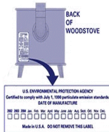
Permanent Wood Stove Label

Wood stoves offered for sale in the state of Washington must meet a particulate emissions limit of 4.5 grams per hour for non catalytic wood stoves and 2.5 grams per hour for catalytic wood stoves.