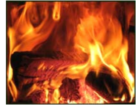
EPA Wood Heater Program

Enclosed is the list of wood stoves certified by the United States Environmental Protection Agency. An EPA certified wood stove or wood heating appliance has been independently tested by an accredited laboratory to meet a particulate emissions limit of 7.5* grams per hour for noncatalytic wood stoves and 4.1* grams per hour for catalytic wood stoves. All wood heating appliances subject to the New Source Performance Standard for Residential Wood Heaters under the Clean Air Act offered for sale in the United States are required to meet these emission limits. An EPA certified wood stove can be identified by a temporary paper label attached to front of the wood stove and a permanent metal label affixed to the back or side of the wood stove (See examples below). Please contact John DuPree at 202-564-5950 should you have questions regarding a particular model line or manufacturer.